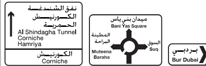
Direction Signs used on other roads/routes