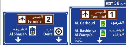
Directions to specific landmarks